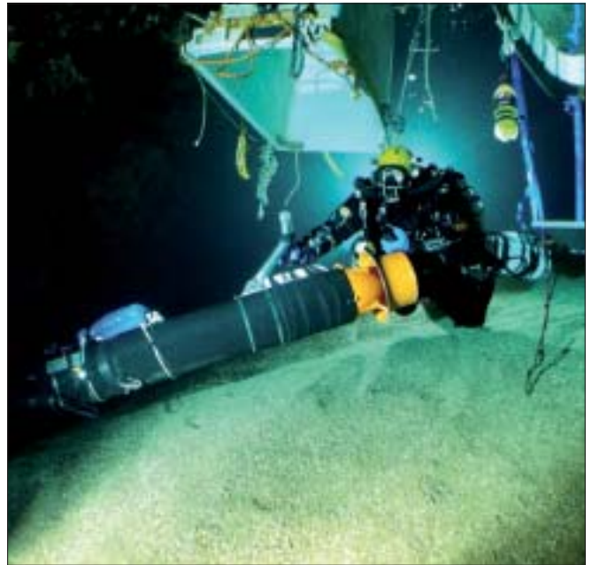
Checks: Mr Houben prepares his scooter for another ride into the deep

Many we do not accept this SIM card on 3G+ cards. Cards accepted: 3G, 3G+, 3G+. Subject to a credit check and connection to a rolling 30 day agreement. 30 days notice to terminate contract. SIM is for use in a 3G handset only. SIMs used in a 2G handset will be deactivated. You may have to activate your handset before you can use your Three SIM. Excessive calls are from the UK to UK landlines beginning 01, 02, 33 and 0847. 3G and 3G+ numbers cost up to 25p per call plus 35p per minute and 1p per text and 10p per minute respectively. Inclusive calls are made land to 3G UK to standard UK numbers and Three-to-Three calls are from the UK to Three UK numbers in the UK. Your travel allowance does not include using your phone as a modem, or pay to post fee stamp. Service limitations and terms apply. For details see Three.co.uk