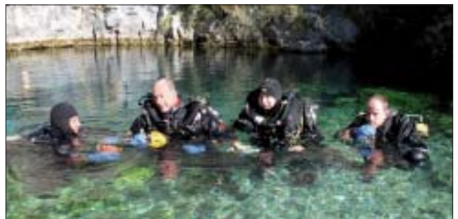
Triumphant: Rick Stanton, Rene Houben, John Volanthen and Jason Mallinson emerge into the sunlight as record-holders on Monday